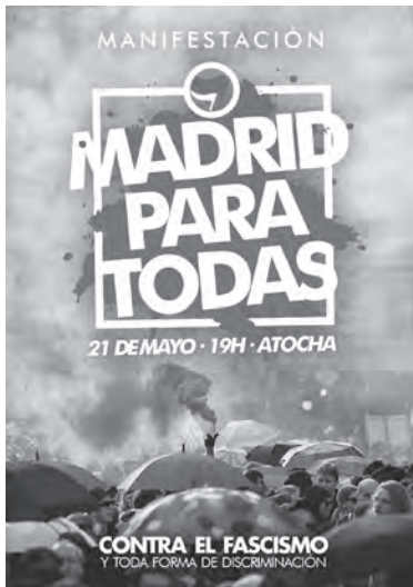
Madrid para todas poster, 2016. “Against fascism and all forms of discrimination.”