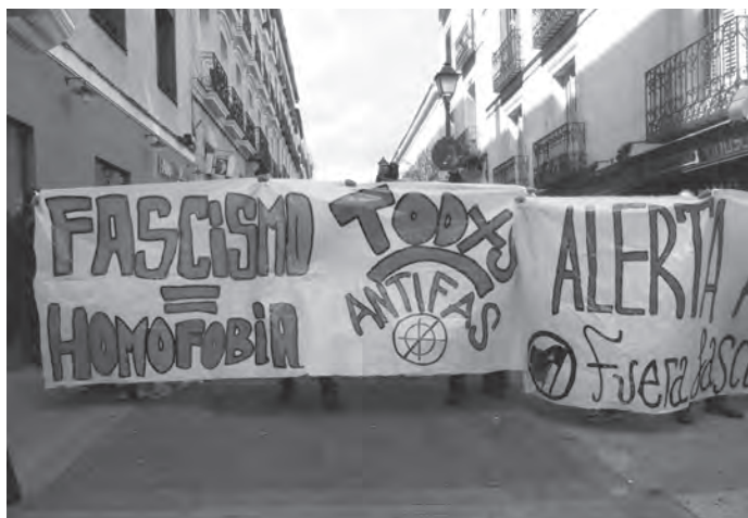
Madrid antifa demo May 1, 2013.

its successor formation, led the authorities to ban the group. Even when Dutch anti-fascists were badly beaten back by fascists from the Nationalistische Volks Beweging (NVB) on one occasion in 2007, the police intervened and arrested the fascists on weapons charges, which caused the group to turn in on itself and subsequently collapse. 400