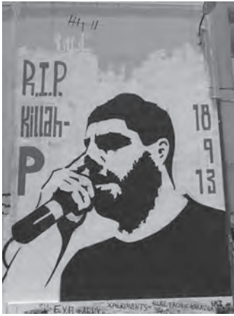
Mural for slain antifa rapper Pavlos Fyssas (Killah P) in Athens.