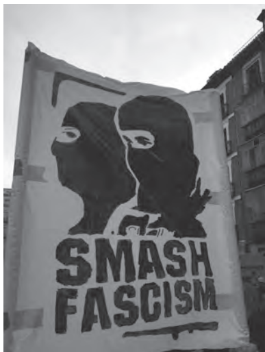
Banner at Madrid anti-fascist march against Hogar Social in May 2017.

The liberal alternative to militant anti-fascism is to have faith in the power of rational discourse, the police, and the institutions of government to prevent the ascension of a fascist regime. As we have established, this formula has failed on several notable occasions. Given the documented shortcomings of “liberal anti-fascism” and the failure of the allied strategy of appeasement leading up to World War II, a more convincing argument can be made that allowing fascism to develop and expand runs the documented risk of sliding into “totalitarianism.” If we don’t stop them when they are small, do we stop them when they are medium-sized? If not when they are medium-sized, then when they are large? When they’re in government? Do we need to wait until the swastikas are unfurled from government buildings before we defend ourselves?